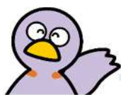
Saitama Mascot, Kobaton