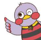
Saitama Mascot, Saitamatch

Saitama Prefecture is committed to supporting the education of high school students through the provision of interest-free loans and school fee reduction systems. Please see the following for more information about the various types of financial assistance available and how to apply.